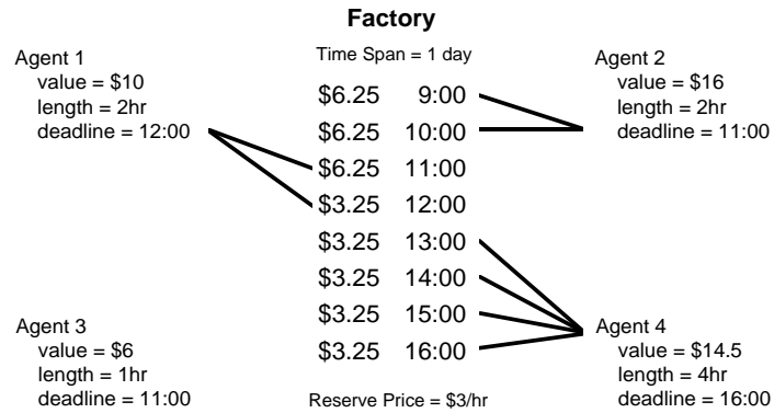
Fig. 1. A factory scheduling market. Lines connecting the agents to time slots represent one feasible allocation. An AuctionBot-based demonstration of the example, in which the subject plays agent 1, is accessible at http://auction.eecs.umich.edu/demos/factory.html .