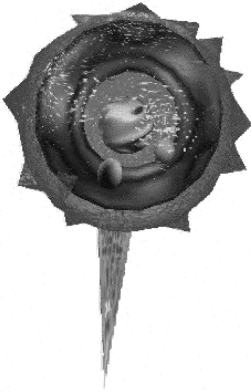
Figure 3 which it can reproduce (Mader, 1993).

Since viruses can only be seen by powerful microscopes, this scientific visualization modeling problem is to acquaint students in recognizing the various shapes and life cycles of viruses through the process of making both a simple physical model and a virtual model of a virus type on the computer. The physical model will be used to demonstrate the major parts of a virus and the computer model will be used to actually model all components of the virus. Animation can later be used to show movement of the virus through its life cycle. Scientists often make these types of models to study possible viral structures, and model ways viruses may bind to host cells. Modeling materials and Truespace will be the primary resources needed for completing this problem.