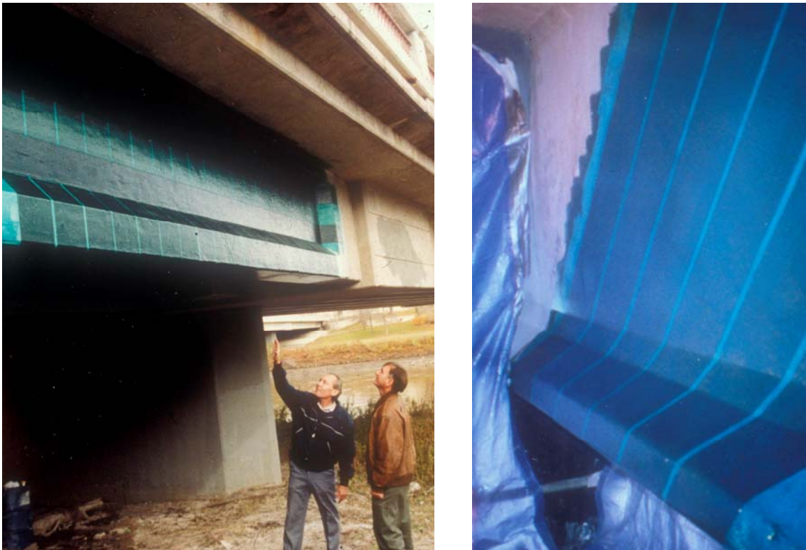
Figure 3: Shear strengthening of prestressed concrete bridge girders using externally bonded CFRP

frequent use of deicing chemicals. Structural health monitoring and inspection of the bridges did not show any indication of corrosion or deterioration during the service life of the repairs.