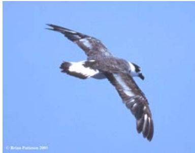
Black-capped Petrel photographed off the North Carolina coast