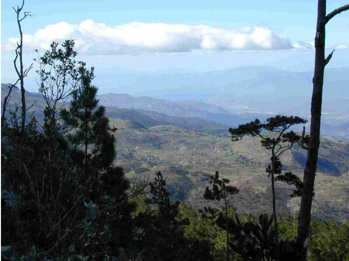
Figure 5. View from the Sierra de Baoruco toward the Massif del la Selle, Haiti. The tree line in the foreground represents the boundary between protected forests in the Dominican Republic and private lands in Haiti.

Our present objective is to return to the colony site in 2003-4 and assess the status of Baoruco nesting colony using a portable radar. The radar, a Furuno color plotting surveillance X-band radar transmitting at 9,410 MHz, is similar to the one described in Cooper et al. (1991). The radar will be mounted on a vehicle to make it portable, and using a continuous plotting function will have a range of 0.75 nm/1.5 km. This method has been used successfully to describe the distribution and movements of Hawaiian Dark-rumped Petrels ( Pterodroma phaeopygia sandwichensis ) and Newell's (Townsend's) Shearwaters ( Puffinus auricularis newelli ) in the Hawaiian Islands (Day and Cooper 1995). We believe radar surveys will provide the best estimate of the size of the Baoruco population and that testing and calibrating the radar on the smaller population in the Dominican Republic will make future surveys in Haiti feasible. We have developed a proposal (Appendix B) for this research which we hope to apply to Black-capped Petrels in the Dominican Republic and Haiti, and migrating shorebirds and passerines in the southeastern United States.