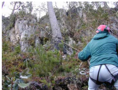
Figure 3. Surveying cliff habitats. Left, Ted Simons, right, Kendrick Weeks.

Access to the cliffs along the ridge to the east of camp was hampered by extremely dense vegetation. In many areas it was necessary to cut trails to reach the cliff face.