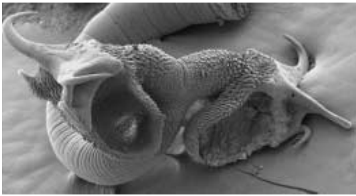
Double grabber. Insofar as a scolex can be called a head, this is a two-headed tapeworm, with one head embedded in the gut of a brownbanded bamboo shark.