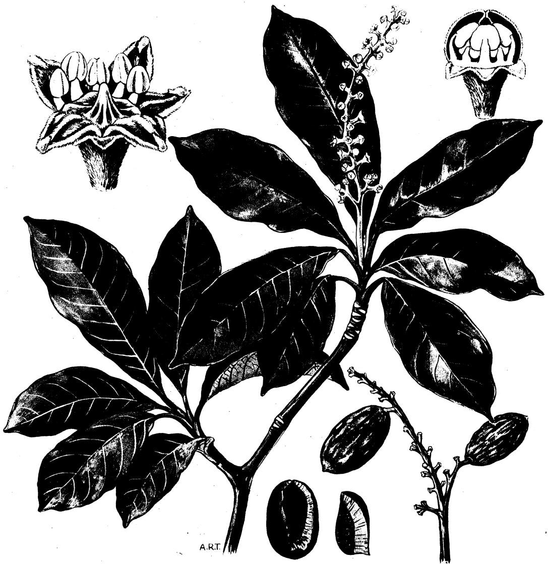
Fig. 1. Diplopanax stachyanthus by A. Tangerini from herbarium specimens. Flowers \times 3 ; branches, fruits \times \frac{1}{2} .

fruited relatives had died out in the late Miocene. The duration of supposed extinction dropped to 4 million years with the finding, viewed as startling at the time (see Czeccott and Skirgiełło, 1975, p. 54), of two fruits in the Pliocene of western Asia. Now we know that the line is not extinct. A woody-fruited species lives in eastern Asia.