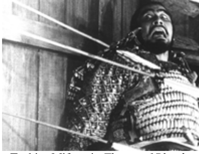
Toshiro Mifune in Throne of Blood