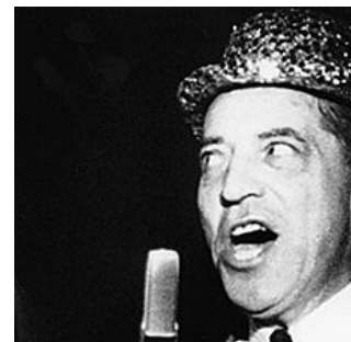
Titicut Follies (1967) Frederick Wiseman