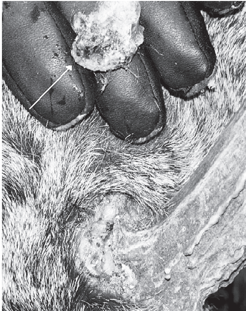
FIGURE 2. Exudate on the antler pedicle of 4.5-yr-old male white-tailed deer at Chesapeake Farms, Maryland, USA, 2006. Note the skull fragment that split away from the antler pedicle.

Maryland, USA, deer were positive for A. pyogenes . Other bacteria identified included Staphylococcus ( n=6 ), Bacillus ( n=4 ), Klebsiella ( n=1 ), and Pseudomonas ( n=1 ; Davidson et al., 1990; Baumann et al., 2001). Eighty percent ( n=4 ) of the A. pyogenes results came from the nasopharyngeal samples. None of the Texas, USA, deer cultured positive for A. pyogenes . Other bacteria identified from Texas, USA, samples included Staphylococcus ( n=8 ) and Bacillus ( n=9 ). The failure to culture A. pyogenes from nasopharyngeal or antler base swabs suggests that presence of this organism associated with intracranial abscessation may be limited at our Texas, USA, site. It is possible the arid climate may discourage growth of A. pyogenes ; however, our study design does not specifically address this question.