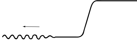
Figure 1: In the co-moving frame, the Turing patterns are pushed to the left from the interface of the front.

that are essentially different from \gamma_1 \geq 0 case. To be more specific, the value of \gamma_1 strongly influences the way the a-priori estimates are obtained. It is important to mention that the proofs of a-priori estimates in both cases \gamma_1 \geq 0 and \gamma_2 - \sqrt{2} < \gamma_1 < 0 are also based on the interplay of the spatially uniform norm and the exponentially weighted norm. According to the author's knowledge, this constitutes a completely new approach potentially useful for larger classes of problems.